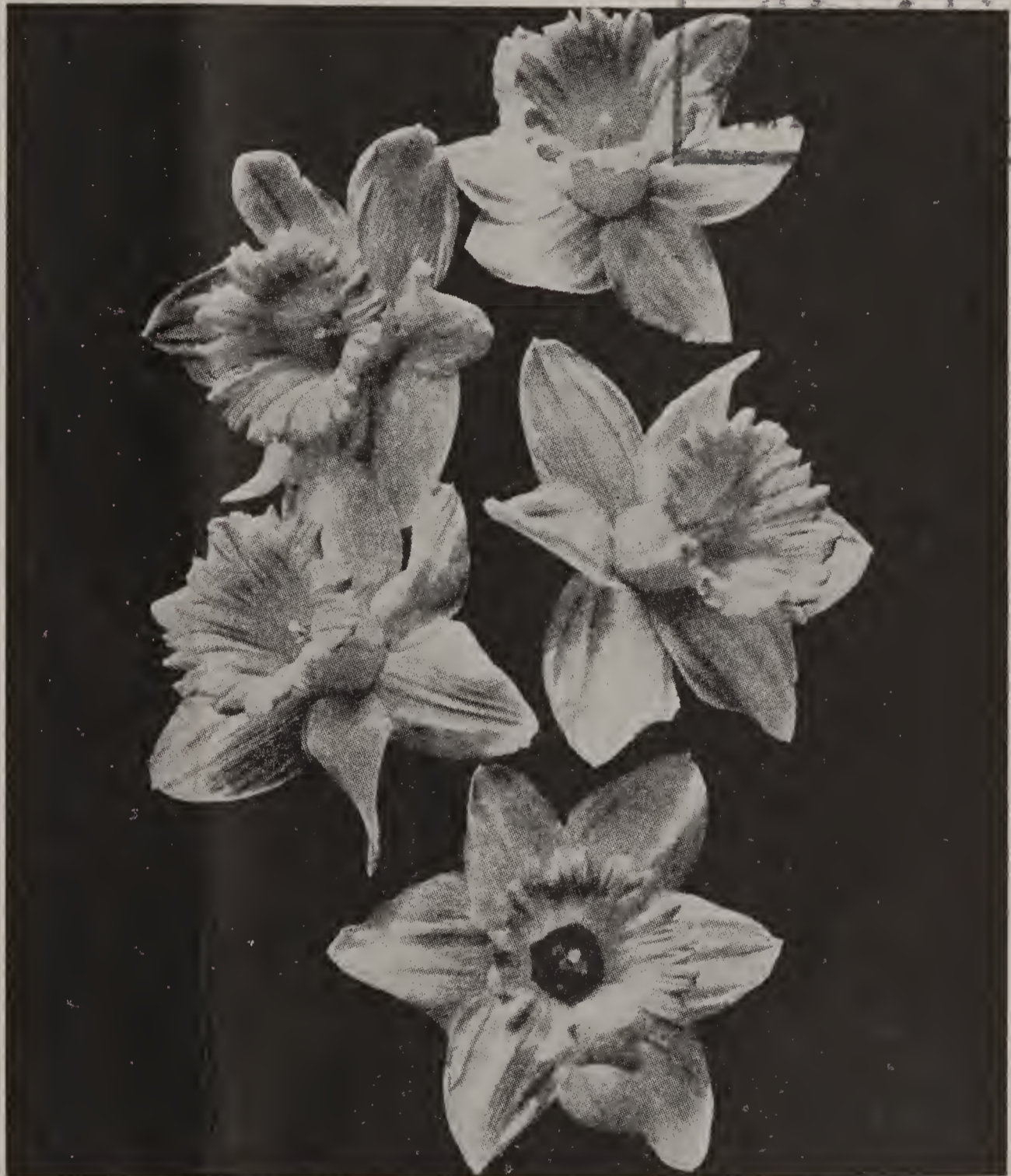
King Alfred Trumpet Daffodil (See Page 2)